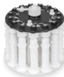
MMR-15 Evaporation/ Concentration rotor