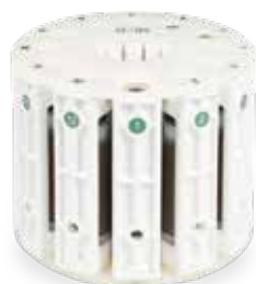
SR-12 Extraction rotor for total fat determination in food