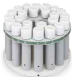
fastEX-24 Extraction rotor for environmental sample

The ETHOS EASY embraces Milestone's philosophy of a "microwave labstation". The ETHOS EASY platform is capable of several applications beyond microwave digestion. Extraction of pollutants from environmental samples can be done in just few minutes, consuming less solvent than other technologies, thereby improving productivity while decreasing costs, all in full accordance with the US EPA 3546. Additional accessories are available to further expand the ETHOS EASY capabilities: additional digestion rotors, inserts and micro-inserts to reduce blanks in the digestion processes, a dedicated configuration for total fat determination in food samples which greatly improves turn-around-time, and an ashing accessory which converts the digestion system into a microwave muffle.