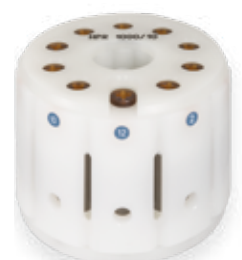
SK-10/12 High-pressure digestion rotor