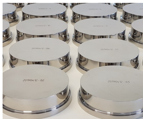
Teclen® Lyoprotect® Stainless Steel Cup VS with serial number

➤ Please see the Teclen® Lyoprotect® Product Catalog for detailed order information.