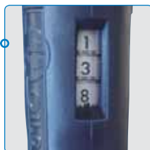
Digital volume indicator