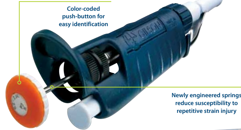
Color-coded push-button for easy identification