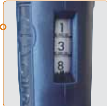
Easy to read volumeter