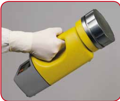
SAS IAQ cod. 90593 - Air Sampler