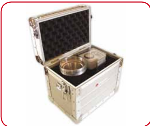
PYRAMID cod. 89389 - Airflow control for SAS