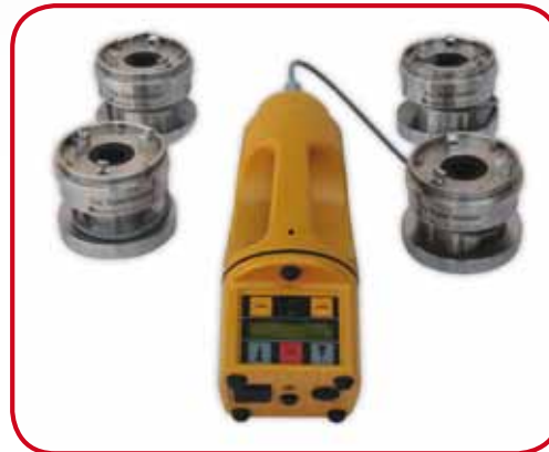
SAS MULTI ISOLATOR cod. 91019 - Air Sampler