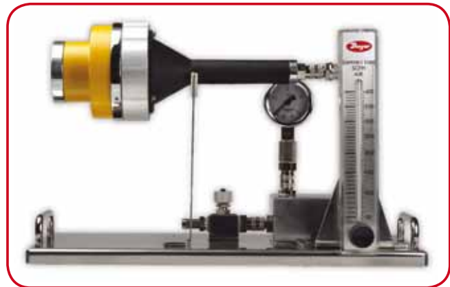
PINOCCHIO cod. 39089 - Compressed Air Sampler