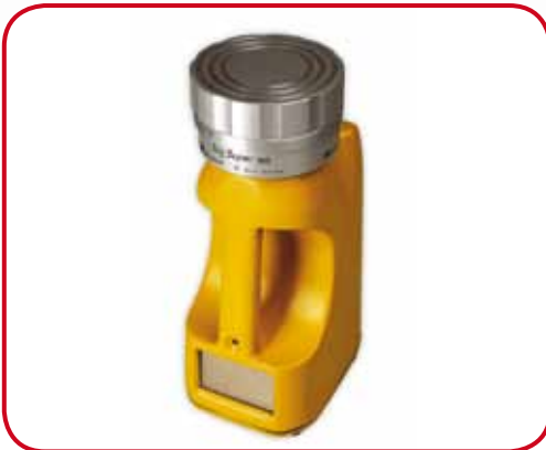
SAS ISO 100/180 cod. 86279 - Air Sampler