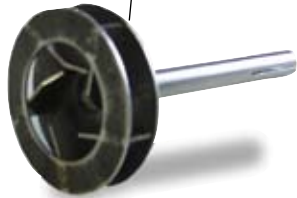
Air-circulation fan in rear wall of furnace