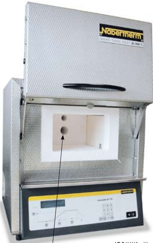
LT 5/11HA with air circulation