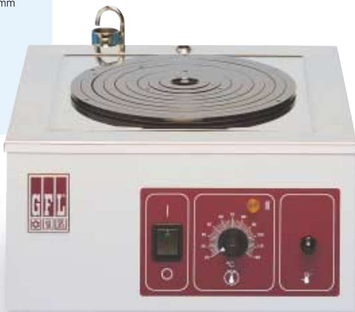
1023 Steam Bath, 7 litres

GFL Water Baths convince through their varied ranges of application. For instance, the Steam Bath's square cover frame (W 265 mm x L 265 mm) is removable. Its 9-part set of rings, made of heat-resistant plastic material can be parted. Its diameter can be varied in approx. 20 mm steps (min. 32.5 / max. 173.5 mm).