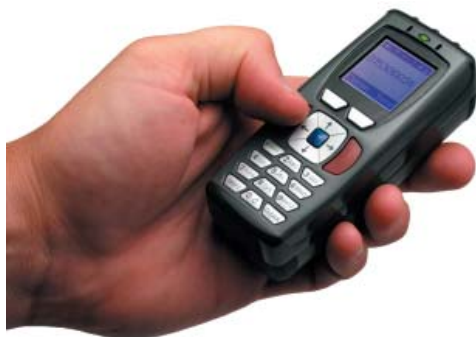
The CR3 will instantly decode all bar and 2D codes

Code eliminates the need for costly, high-overhead operating systems by providing an open platform JavaScript development environment within its CodeXML Applications Development Suite. With CodeXML and JavaScript, developers and Information Technology organizations no longer need to worry about expensive porting of applications between Windows, Windows Pocket PC, Windows CE.Net, et.al.. A unique feature of the Applications Development Suite is the ability to protect both development investment and data security by a customer-unique key encryption, which allows the developer to control the distribution and modification of applications to specific serial-numbered CR3 units. Code offers an easy to use tool for creating complete data collection applications for the CR3, without programming. You can design menus and input screens, control scanning and keypad entry, use look-up tables to validate input and send data to and from the CR3. All with a "point and click" interface on your windows PC.